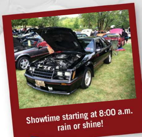
Showtime starting at 8:00 a.m. rain or shine!