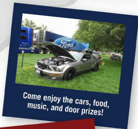
Come enjoy the cars, food, music, and door prizes!

9423 W. Lincoln Hwy., Frankfort www.fordoffrankfort.com